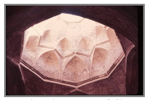
Window in the Great Mosque of Isfahan